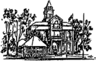
Cumberland County Courthouse